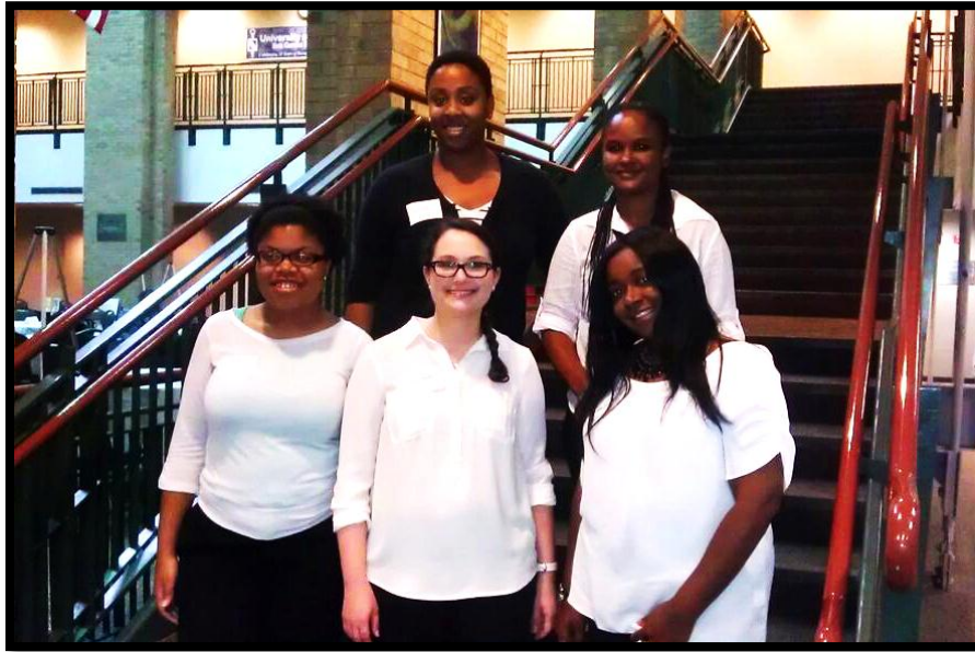
Special thanks to our student volunteers!